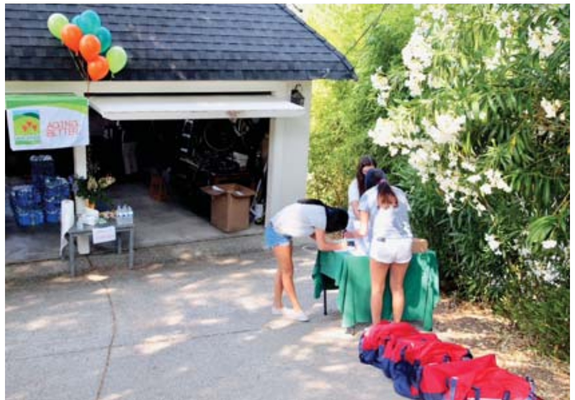
Volunteers work hard Aug. 1 to fill emergency go-bags which will be delivered to seniors in the Lamorinda Village community.